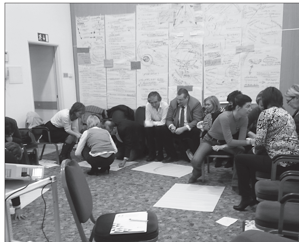
Figure 1 • The the work and the wall with the group memory

These definitions, methaphores and schemes are recorded on flipcharts together with records of the process that engendered them. During the training the flipcharts are posted on the walls. They are reminders of the common journey. The wall is the group memory that helps participants consolidate the relevant knowldege, remember the connected emotions and reflections, and build them all together to support a change in attitude.